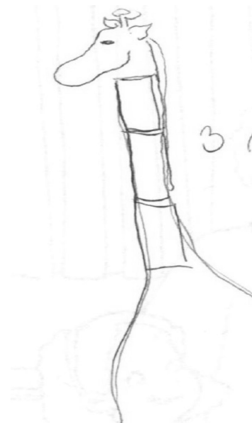
Figure 2: The incorrect drawing of giraffe vertebrae in which a number of vertebrae is smaller than a real number.